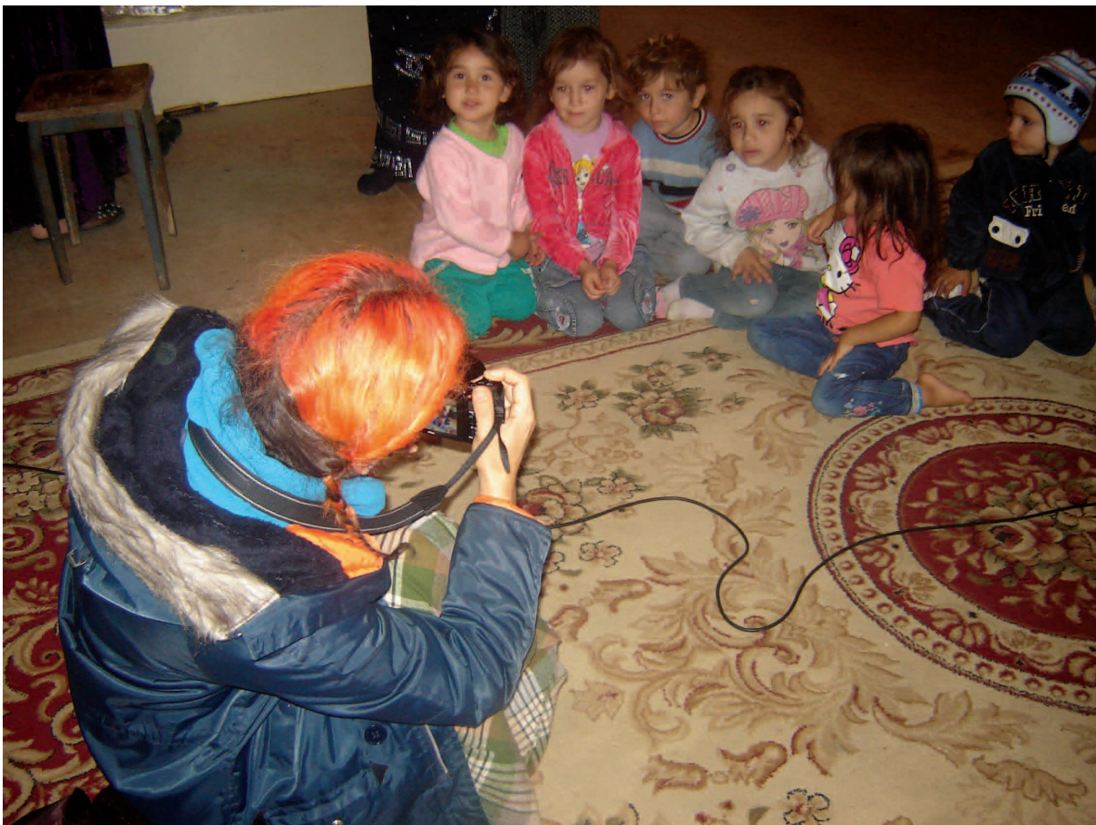
ADC "Memorial" observer takes photos of Roma refugees from Donetsk in Rostov Oblast, Russia.