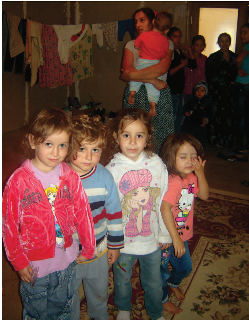
Romani refugees from Donetsk in the Rostov Oblast.