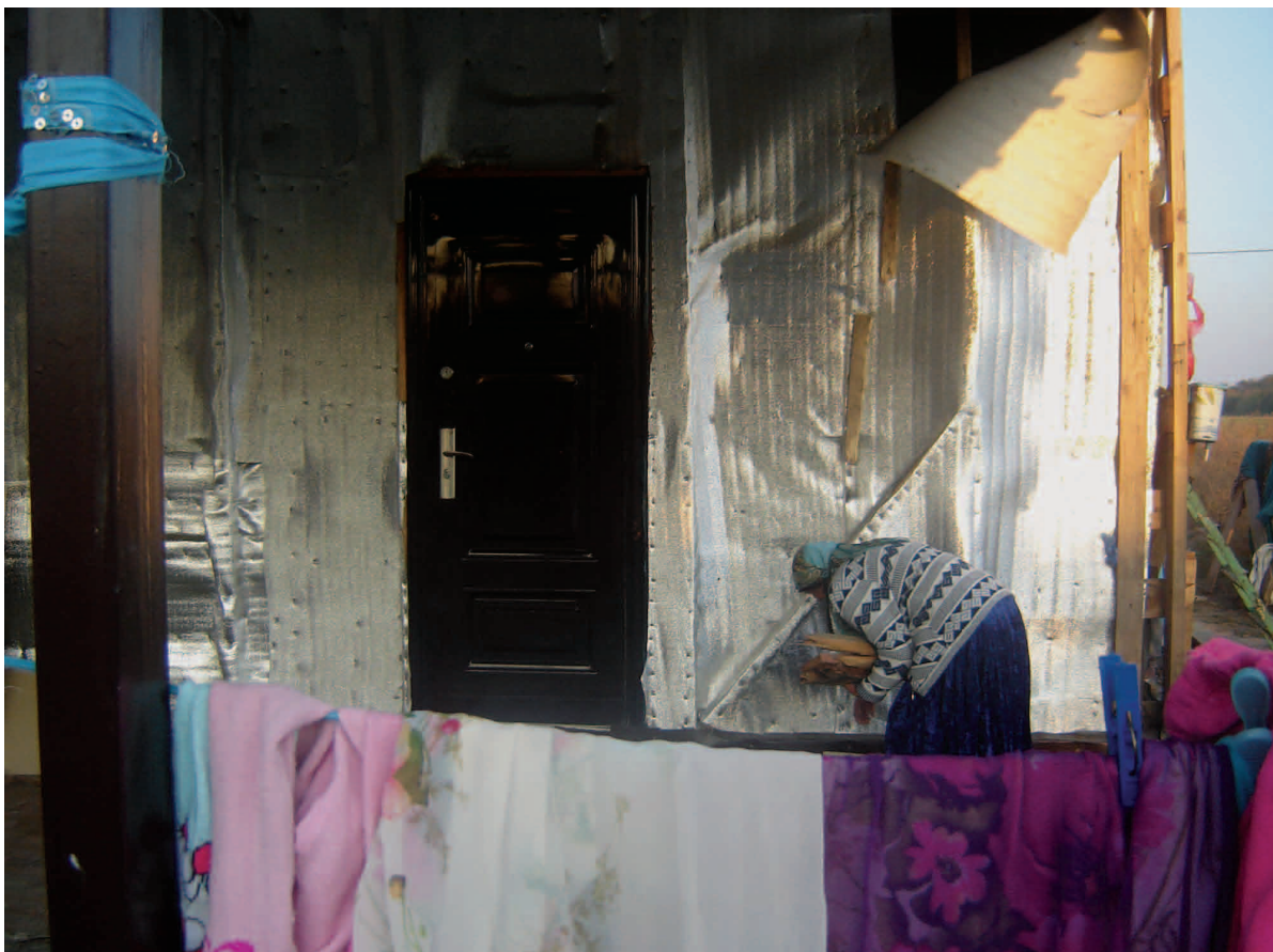
Temporary housing with insulation made from scrap materials. Bataysk, Rostov Oblast, Russia.

It is very hard for Romani men, who are the main breadwinners in the family, to work in these new conditions. The traditional occupations of Kotlyar Roma—metalworking, reselling metal, and collecting and selling scrap metal—are not very profitable in these new locations. Men cannot officially accept a