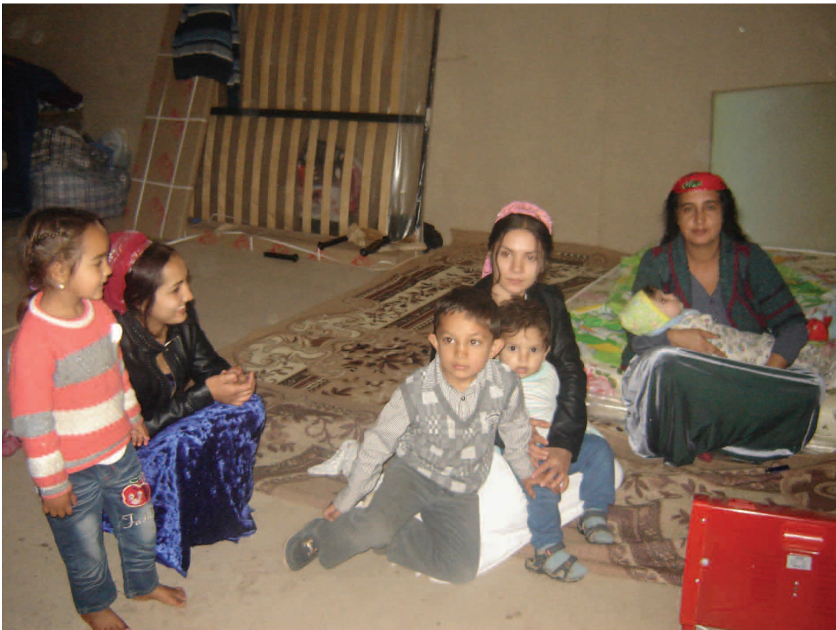
Displaced persons from Dnipropetrovsk region (Ukraine) in Rostov Oblast (Russia)