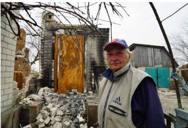
Entering the village of Ivanivka, Chernihiv region, on March 5, the Russian military fired on private homes, sometimes damaging almost every house on the street