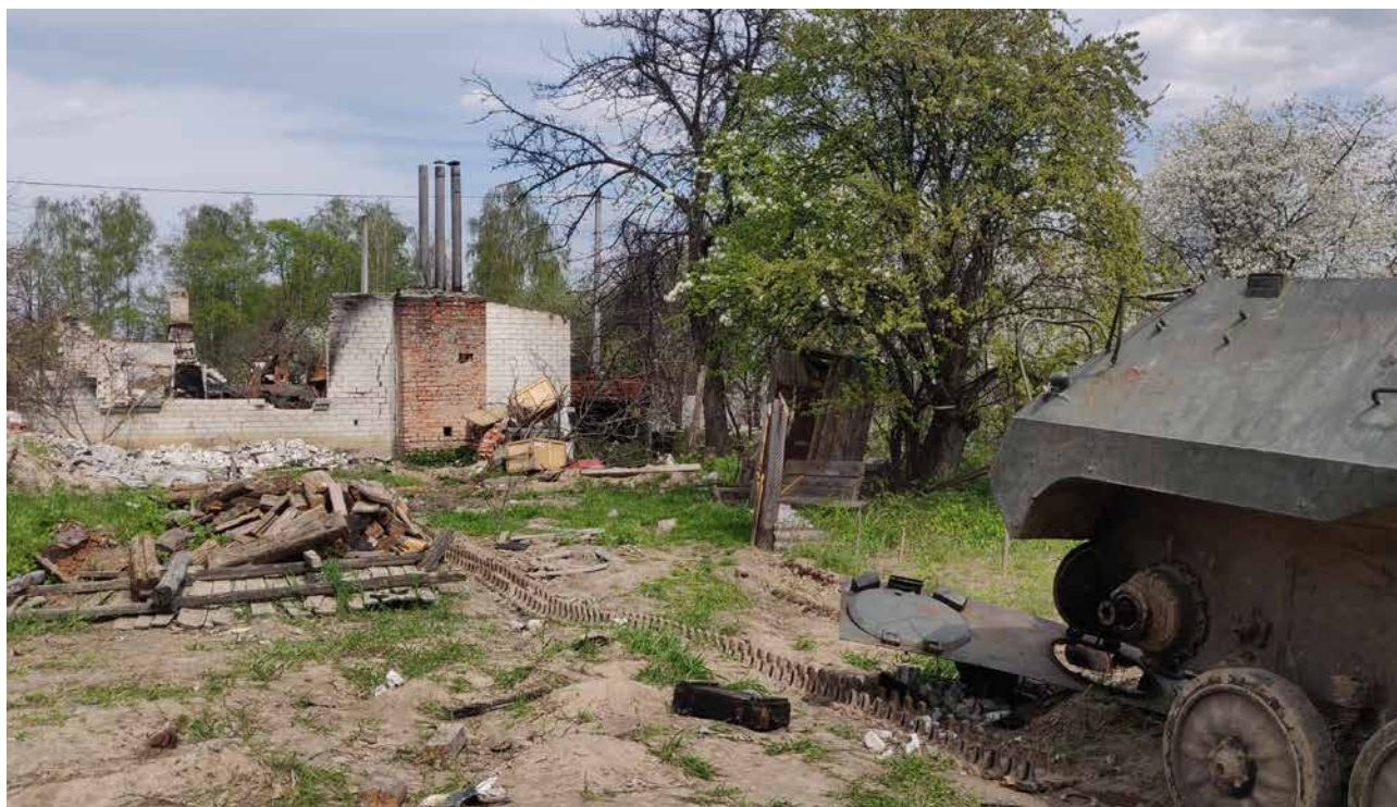
In Yahidne, traces of Russian military presence are everywhere. Russian army food boxes, empty liquor bottles, military gear, and soldiers' personal items are spread across the school premises. Burnt vehicles, pieces of shells, and other combat remnants line the streets

So far, municipalities have borne a large part of the financial burden. They take the funds from local development budgets, suspending ongoing development projects. The Kolchins'ka community had to stop the construction of a school, while the Kholmiv'ska community spent funds reserved for road infrastructure maintenance. The regional administration plans to add 20 million UAN to the local budgets.