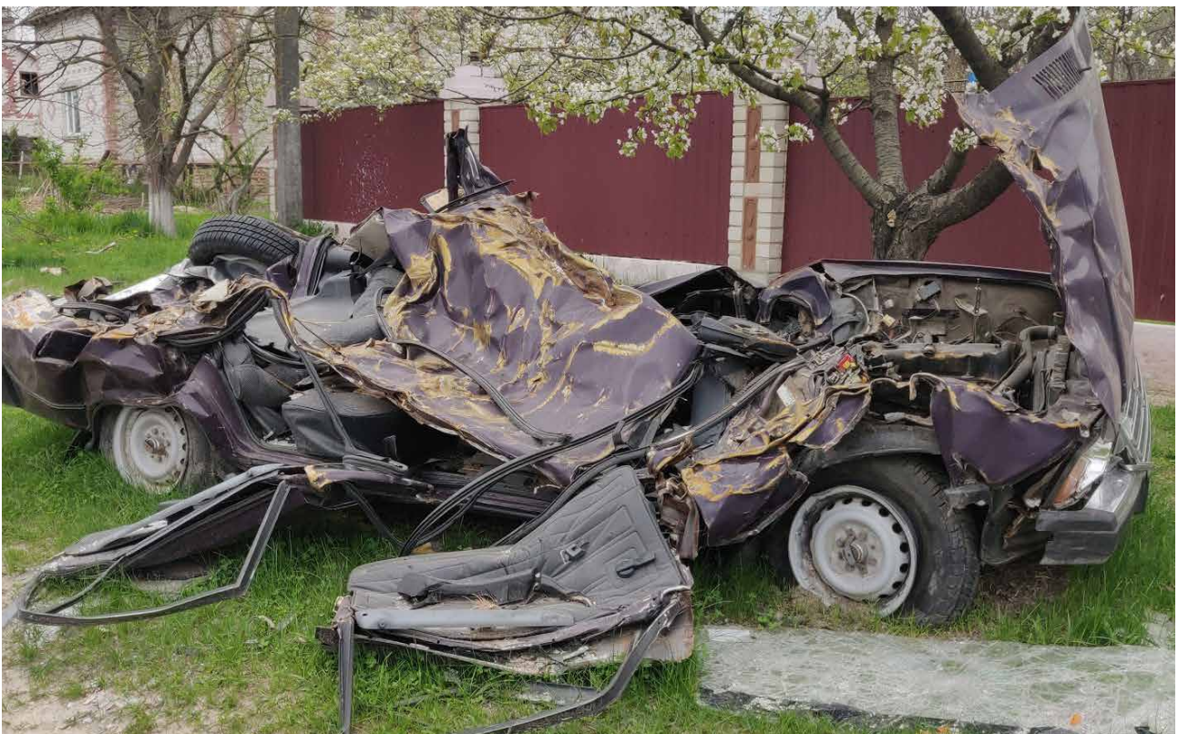
A tank drove over this car in the village Yahidne

members from Ukraine, Germany, France, and the Czech Republic including a member from the German/Swiss Human Rights Organisation Libereco Partnership for Human Rights monitored human rights violations, violations of international law, and consequent local humanitarian problems and needs in the Chernihiv, Kyiv, and Sumy regions. Russian armed forces withdrew from these regions in late March 2022, leaving a trail of death and destruction. Consequently, inhabitants and local authorities are facing challenges, including a dire humanitarian situation, the need to reconstruct thousands of homes and significant infrastructure, and recovery. The mission also monitored the situation with internally displaced people (IDPs) in the Zakarpattia region, where high numbers of IDPs are straining local capacities and infrastructure.