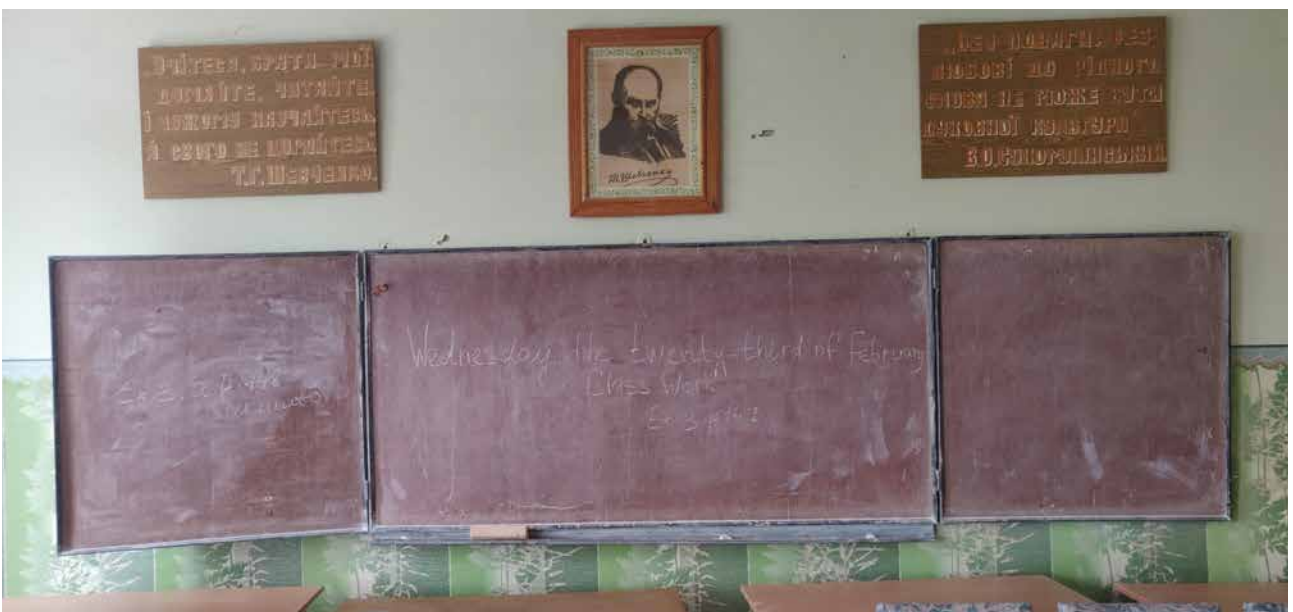
The contrast between war damages and board notes from the last regular day is striking, school in Kolychivka / Chernihiv Region