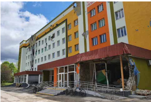
Trostyanets hospital is a new build hospital with a well-equipped polyclinic. Due to shelling and bombing, a lot of equipment and parts of the buildings were destroyed. The hospital leadership is very engaged in restoring the function of all hospital departments as fast as possible

The perception of Russian soldiers seems also defined by the destruction and litter they left behind. In all the localities the monitoring team visited, looting of shops,