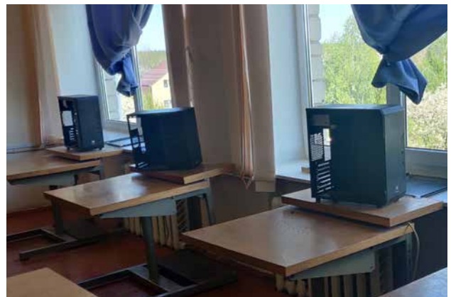
Looted hard discs at the school in Katyzhanka