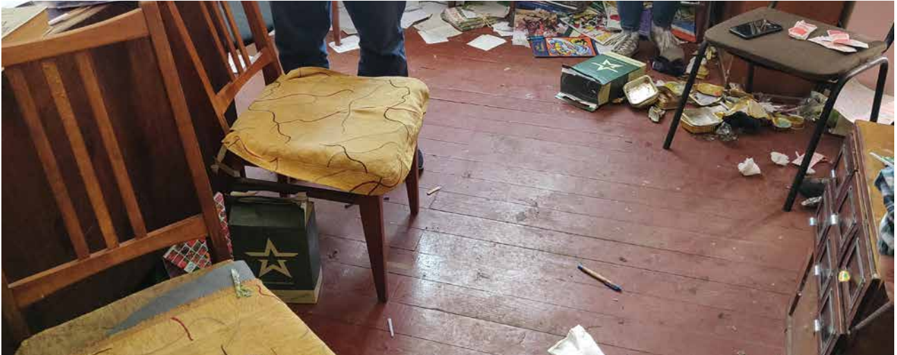
Russian soldiers managed to devastate Katyuzhanka's library in only 24 hours. They burned Ukrainian literature to keep warm, reported the librarian