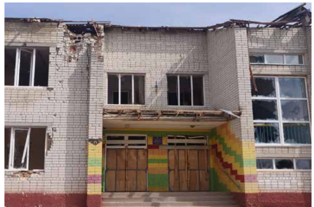
Damaged school in Kolychivka

Civilians were subject to various threats: Russian soldiers threatened to shoot every third person if owners of laptops and smart watches did not turn them in. Women