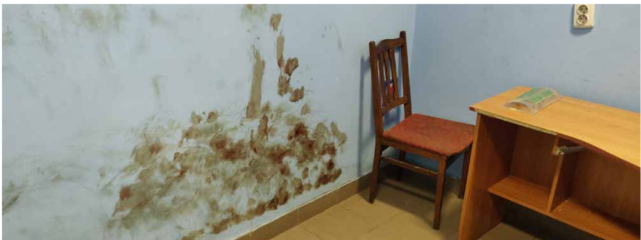
Traces of blood in the basement of Trostyanets railway station

When Russian soldiers withdrew from the school, they left complete chaos. Apart from looting, they cut cables,