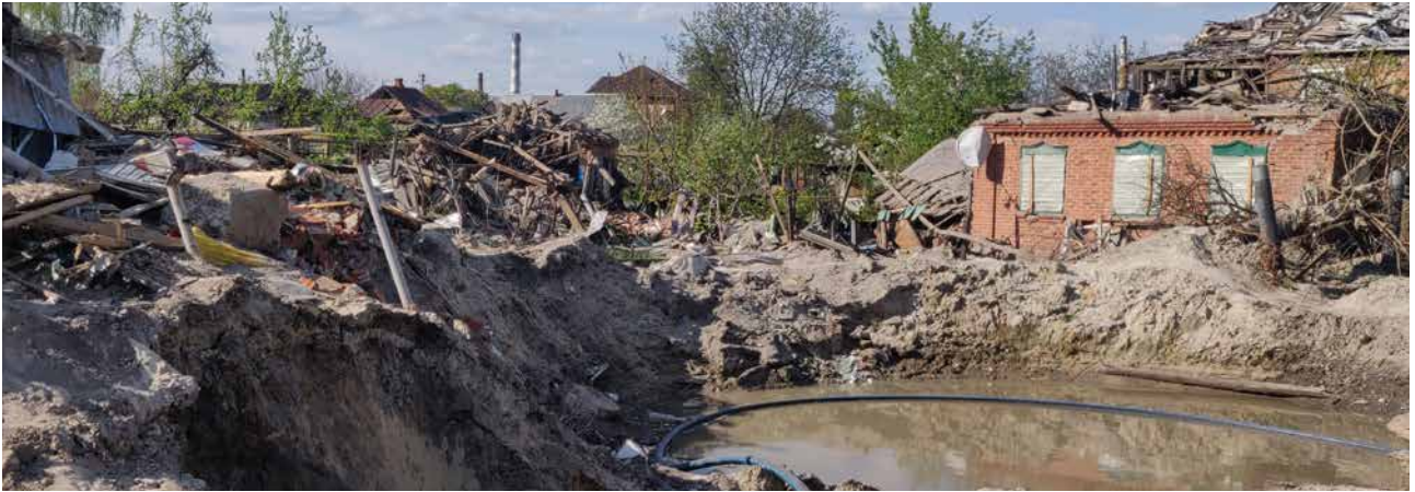
In the city of Oktyrka, where the Ukrainian army halted the advance of Russian troops, administrative and residential buildings, a thermal power station, water pipes, and drains heavily suffered from shelling