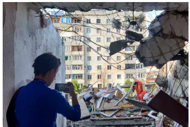
Destroyed residential building in Okhtyrka in the Sumy region