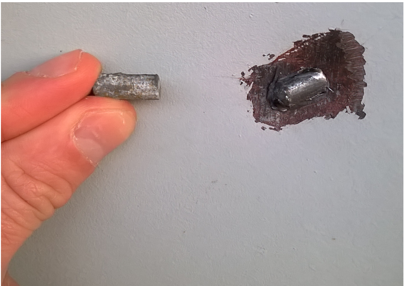
Cluster sub munitions collected from a wall in the garage complex Venera. Numerous munitions of this type were found in all locations visited.

As the result of the shelling nine civilians and eight Ukrainian soldiers were killed. Another 35 residents, five of whom are children, received injuries of various severity. All the deaths and injuries of the civilian population were caused by fragments of exploded cluster munitions, which was evident from the many fragments and casing found around the places where the victims' bodies were found and the traces of damage around the areas which were hit. Military objects sustained damage as well as residential buildings and medical institutions within the city.